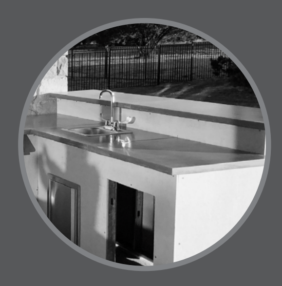
Pre-Cast Concrete Countertops