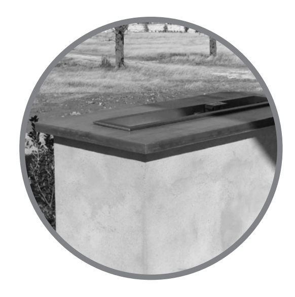
Pre-Cast Concrete Countertops