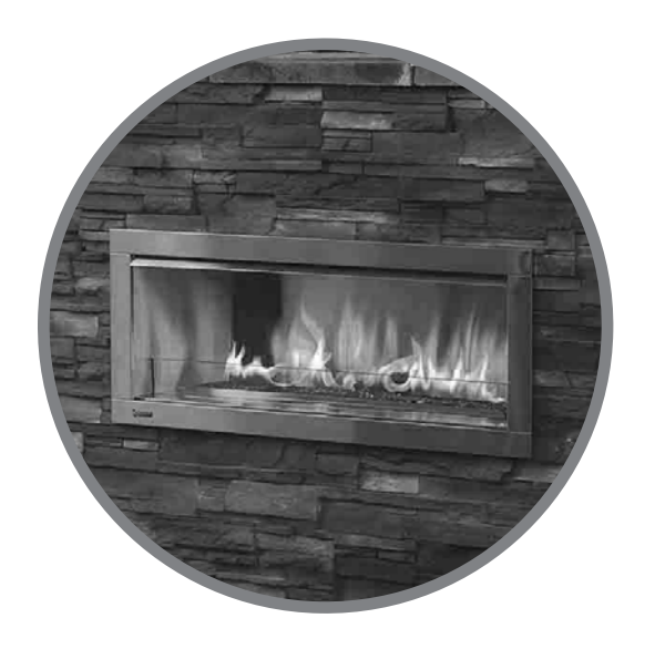
Fire Pit Burners & Vent-Free Gas Fireplaces