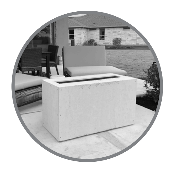
Veneer-Ready Cabinets System