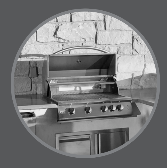
Appliances & Storage Accessories